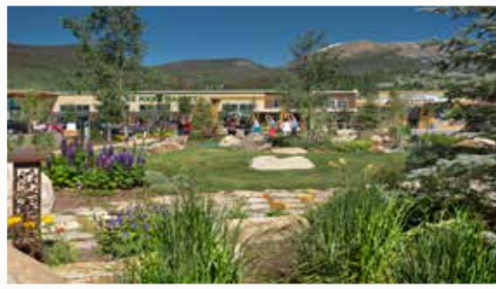
WHOLE FOODS MARKET