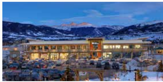
OUTDOOR WELLNESS BUILDING